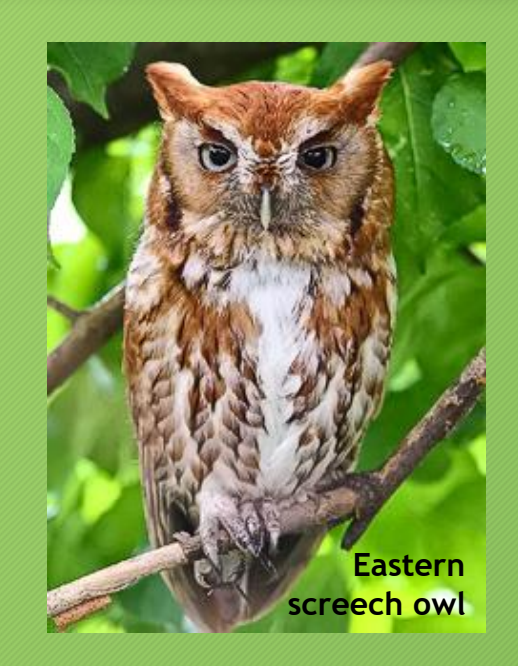
Lives in a Woodland or Forest