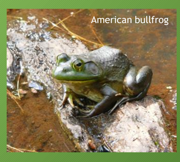
Lives in a Freshwater Pond, Creek or River