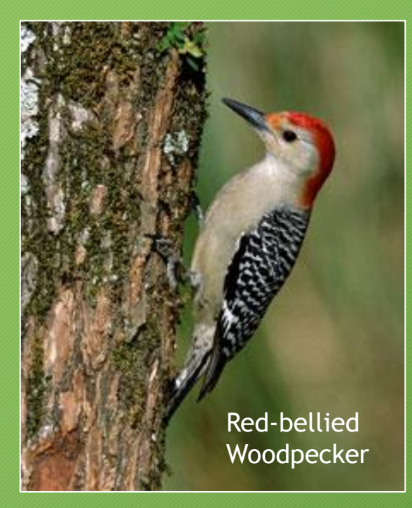
Forested habitat with tree cavities for nesting