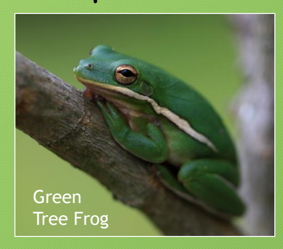
Freshwater pond for laying eggs