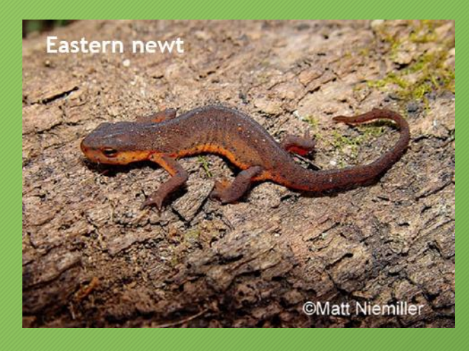
Lives in a Forest near a Freshwater Creek