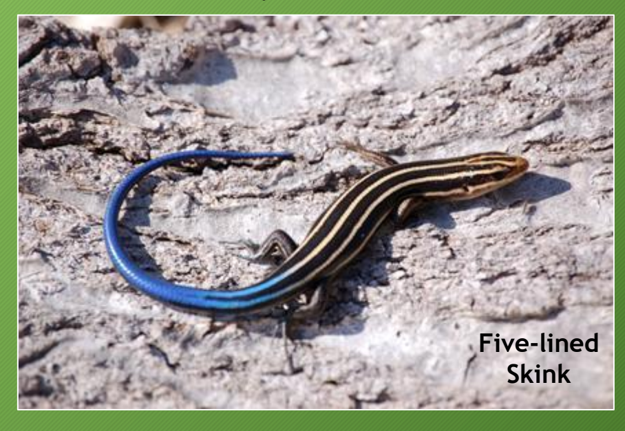
Partially wooded habitat with rocks for basking in the sun