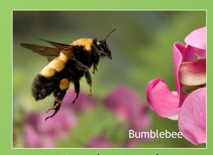
Meadow with flowering plants that provide nectar