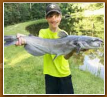
Hunting & Angling Heritage AWF's work to foster policies and provide programs and opportunities for youth and adults to have abundant and quality

AWF's outdoor education facility at our state headquarters that provides staff led, outdoor hands-on field trips to 10,000 youth and school group attendees each year.