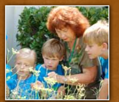
Alabama Outdoor Classrooms AWF's work with over 395 schools across Alabama to develop and utilize outdoor hands-on learning stations on school grounds.