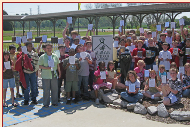
West Morgan Elementary students love to watch the free Discovering Alabama DVDs that the school received upon completing AOC certification.

For more information and to download free Discovering Alabama Teacher’s Guides, visit www.discoveringalabama.org .